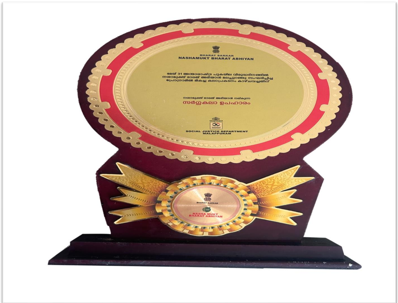
Figure 6- Award for Bharat Sarkaar Nasha Mukta Bharat Abhiyan

The NSS unit of the KAHM Unity Women's College, Manjeri awarded for the best arts performance in the program on world no tobacco day celebration conducted by Nashamukt Bharat Abhiyan Social Justice Department, Malappuram.