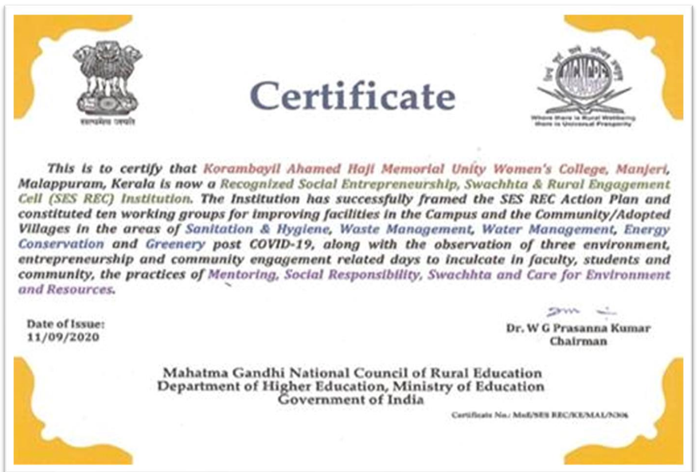
Figure 3-Certificate recognized by SEC REC institution

Mahatma Gandhi National Council of Rural Education ,Government of India Awarded for the successful framing of SES REC Action plan and constituted ten working groups for improving facilities in the campus and community/adopted villages in the areas pf sanitization & hygiene, waste management, water management ,energy conservation and greenery for improving facilities in campus and community.