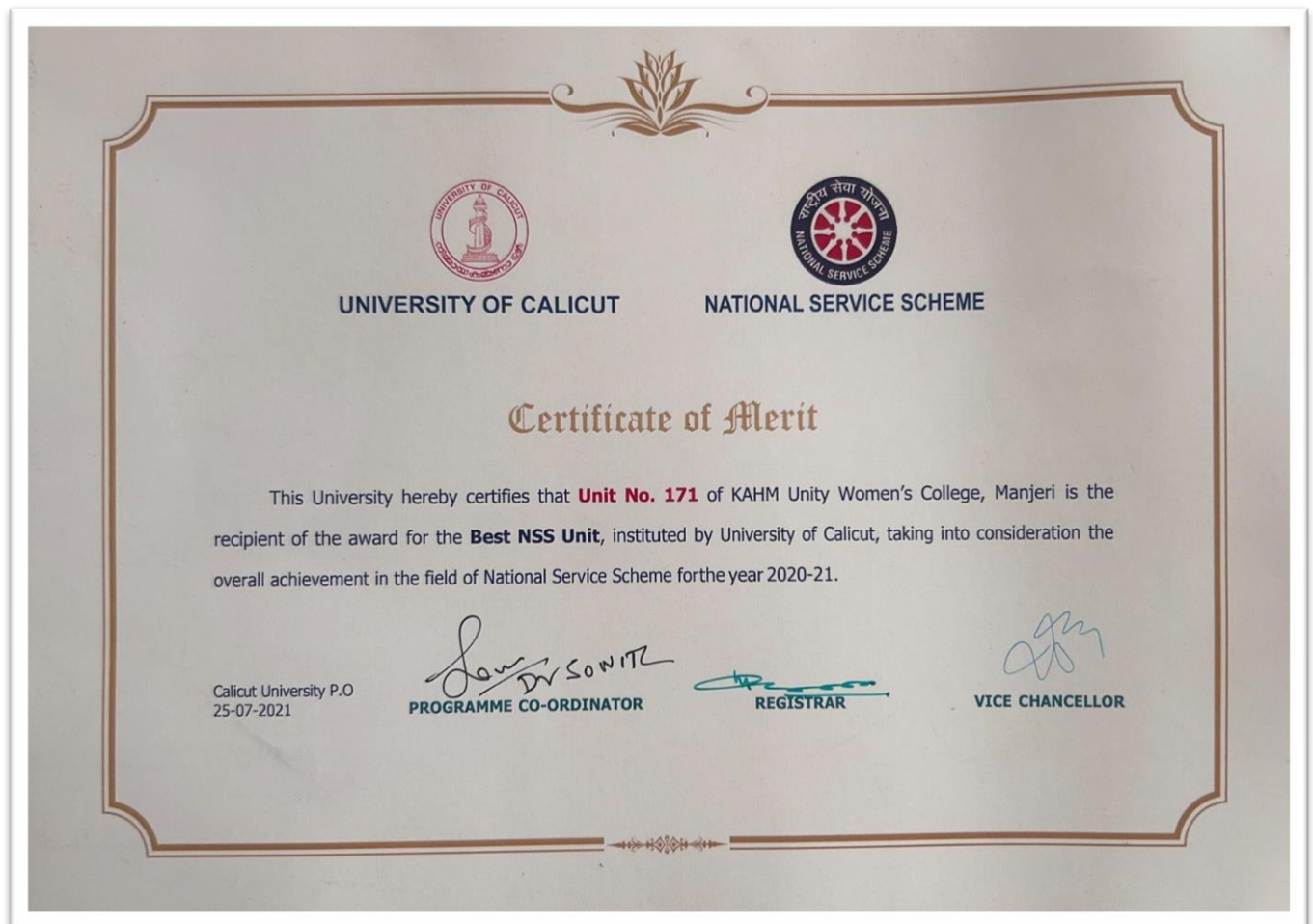
Figure 5-Certificate of Best NSS unit Award

Nss unit of KAHM Unity Women's College ,Manjeri was selected as the best Nss unit award from National service scheme,under Calicut university.